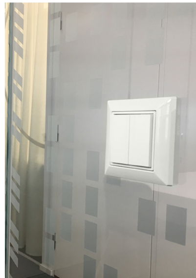
Wireless Control Panel mounted on a glass wall